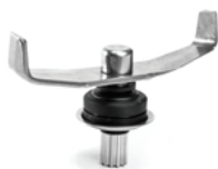
Blunt safety blade 10X STRONGER than traditional blades