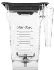
BPA-free forside jar 4-SIDES for a better blending vortex